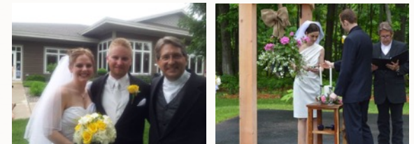
Florian Garden's Eau Claire, WI. Beautiful Personal Residence WI.

Complimentary consultation (in person or by Skype/FaceTime), Semi-private wedding (the couple and up to 10 guests) Travel to the Ceremony Venue*, Administer the Oath of Marriage, Officiating the ceremony on your wedding day, Details about obtaining certified copies of your marriage record and changing your name